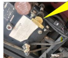
Oil Dip Stick! It has a lock position