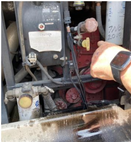
The Discovery! After 200 Miles