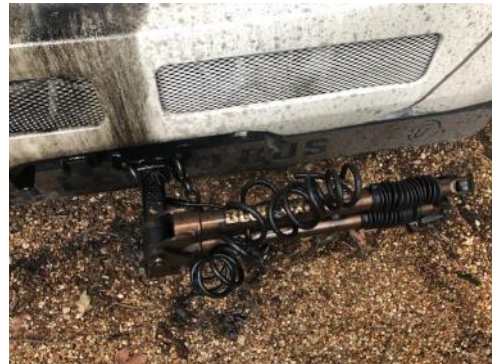
Tow Components will no Longer Rust!