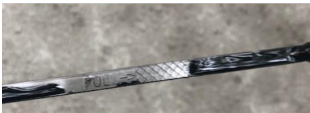
Looks to be about 1/3 of the oil missing, It was full when leaving Fredericksburg