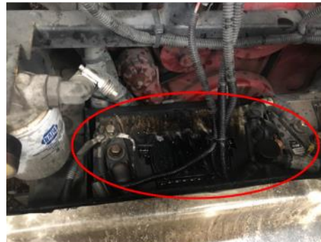
And some on the engine Batteries!