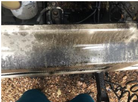
Seems that the oil went most every where!