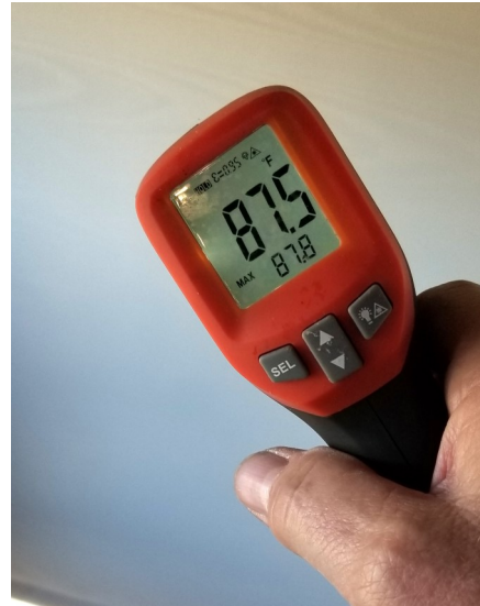
Temp with screen 30 min later