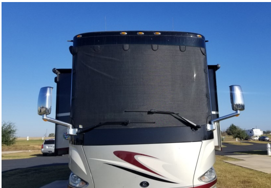
Daytime no one can see in