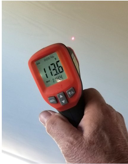
Temp without screen.

I have been asked several times about how well the black sunscreens work in keeping down heat. I recently had the opportunity to test the difference in temperature both with and without the exterior screens. We pulled into spot facing the afternoon sun and while I was setting up just dropped the front shades, both the solar shade and the night shade. I took a temp reading on the inside of the night shade, installed the exterior screen then took another reading thirty minutes later. See for yourself how much difference it made. Yes, the inside front screen(s) will keep heat from the interior, but they trap heat between them and the windshield which is radiated back into the coach. As for visibility, the shade acts like a one way mirror, you can see out in the daytime but no one can see in. Nighttime you had better keep the shades closed because the screen becomes invisible.